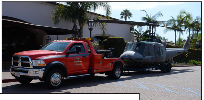
The colorful Thomas Towing truck hitched to the olive drab VVA 218 Huey Helicopter on display at Fess Parker's Double Tree Resort, Santa Barbara on September 9 for “Vietnam: The War and Its Veterans 50 Years On” presentation by the Pierre Claeysens Veterans Foundation.